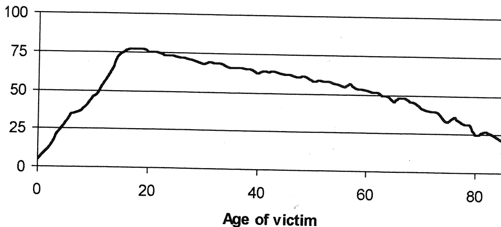
Figure 3. Percentage of homicides involving guns by age of victim, United States, 1976–2002

Best: "Among victims aged 15 and older, the percentage of homicides involving guns is inversely related to age. For example, more than three-quarters of teenage homicide victims were killed by guns, compared to less than one-quarter of victims aged 80 and older (Figure 3)."